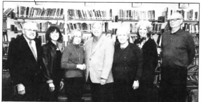
City Council Swearing-In ceremony.

Saturday, April 18, is the semiannual Operation Brightside Cleanup. Volunteers should meet up in the parking lot by the Stock Yards Bank at 9:00 A.M., rain or shine. Gloves, trash bags, t-shirts, coffee, and doughnuts will be provided. This is your opportunity to contribute to the beautification of Windy Hills.