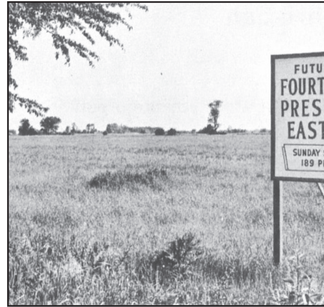
1955 Calvin Church Planted