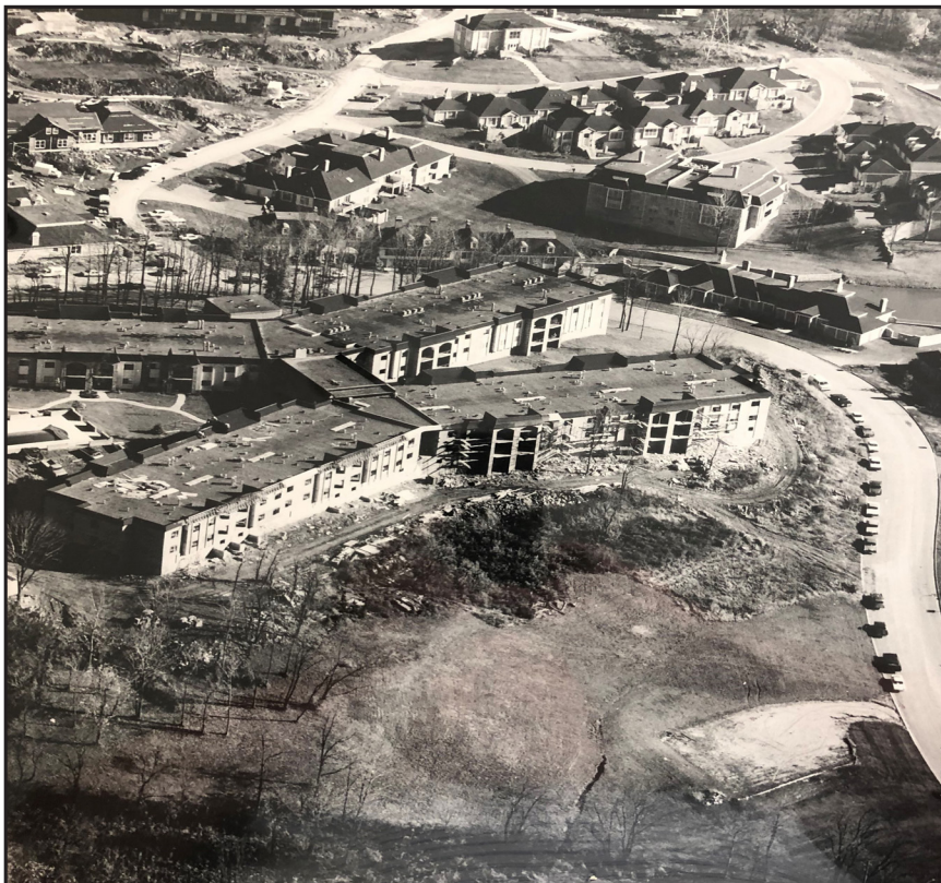
1976 Coach Gate Under Construction