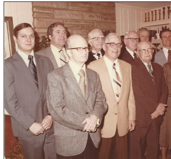
1978 City Officials