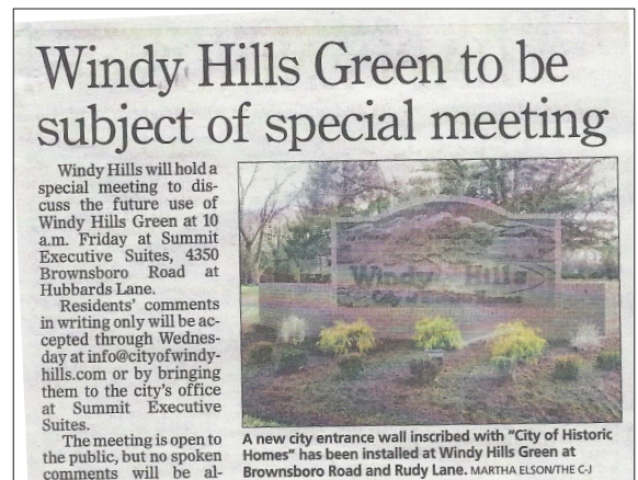
2005-2013 The Windy Hills Green