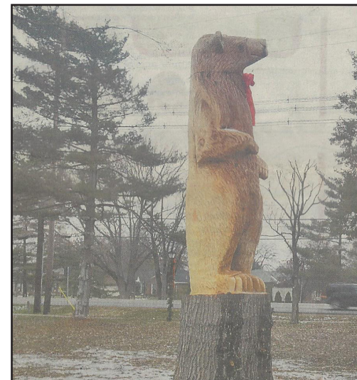
2000 Rudy the Bear is B