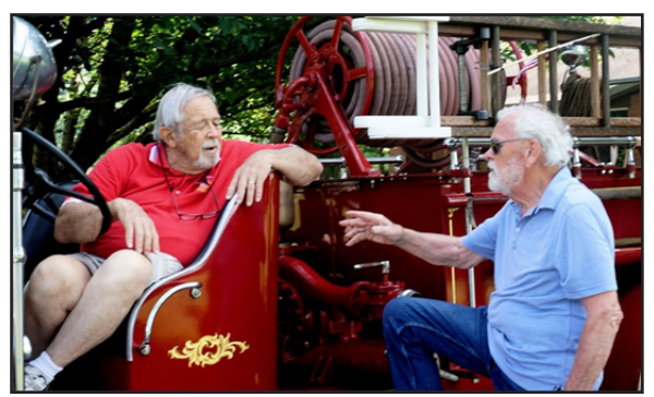
Fire Engine and Drone Photo of "The Kids' Zone"